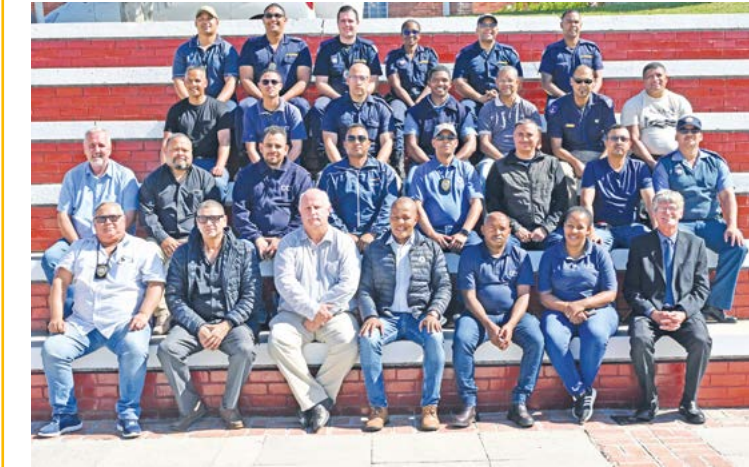
Wired to catch cable thieves: Metals Theft Unit officers attended a session by the Southern Africa Revenue Protection Association in mid-April to further improve their ability to clamp down on those perpetrating essential-infrastructure crimes.

Keep 'em calls coming Please continue helping the City bust metal thieves by calling the 24-hour toll-free tip-off line on 0800 110 077. Rewards are on offer for information leading to the arrest and conviction of metal thieves.