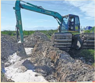
Better safe than sorry: Dredging of the Kuils river upstream from the Khayelitsha wetlands is a precautionary measure to guard against flooding in surrounding communities once the winter rains hit.

The City is undertaking maintenance on the Kuils river and the Khayelitsha wetlands, specifically along the 1,2 km section from the N2 to Spine Road. The aim is to help protect surrounding communities Qandu-Qandu, BM Section and Greenpoint against flooding in the event of heavy winter rains. The R450 000 project involves dredging the river, which lies upstream to the wetlands, to remove silt and deepen its bed, as well as constructing sand berms along the banks. The Kuils river is approximately 30 km long and runs from east of Kanonkop, Durbanville, through areas such as Kuils River, Mfuleni, Khayelitsha and Sandvlei, where it converges with the Eerste river.