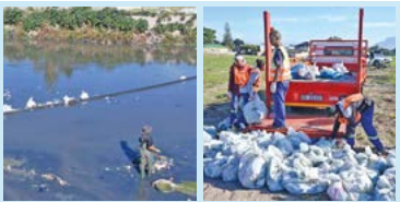
First you trap it, then you toss it: Determined to improve the quality and cleanliness of Cape Town’s waterways, the City partnered with The Litterboom Project and the Rondebosch Golf Club to clean a section of the Black river in the run-up to Earth Day in April. Workers from the Water and Sanitation as well as Urban Waste Management directorates helped remove litter trapped by a strategically placed litterboom.

A collaboration between the City’s directorates of Safety and Security as well as Urban Mobility recently culminated in the launch of the Road Safety Learner Centre in Mitchells Plain. The facility, operated by Traffic Services’ Road Safety Education Unit, uses a miniature road layout to teach young learners how to safely cross a road, how to observe and listen, how to read road signage, and the importance of safety belts and general road safety. The initiative was facilitated by the South African Road Federation (SARF), a non-profit that represents various groups with an interest in roads and transport. Lobbying government on traffic safety and transport-related issues is one of SARF’s primary functions. The City’s Road Safety Education Unit regulates traffic around pedestrian crossings near schools, coaches scholar patrols, and delivers road safety talks at schools and early childhood development (ECD) centres. In 2023, their talks reached 10 148 children at 29 schools and ECD facilities.